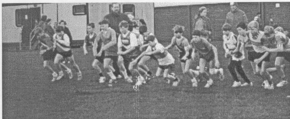
The under 13 boys start.