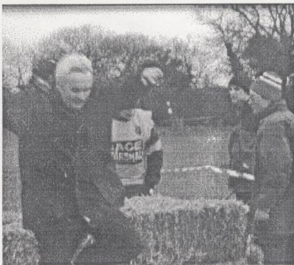
Some of the many Headington helpers testing out the jump